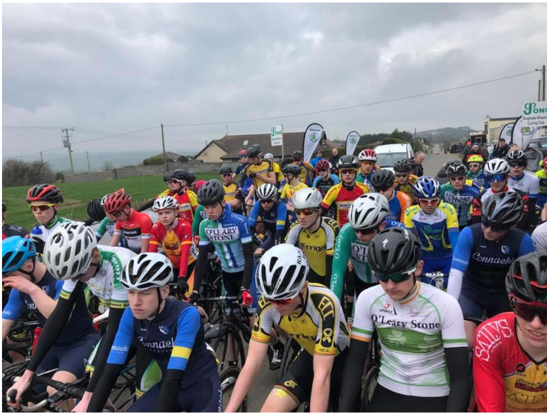
The riders lining up before the start of stage 1 in the U16 Boys event in 2018.